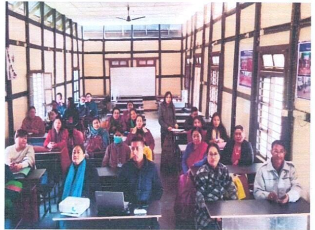
Fig 2: Participants of the programme

Notes: After the completion of this workshop students felt encouraged exploring the areas further.