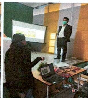
Fig. 3. Interaction session

At the end of the programme the participants were satisfied and happy that the knowledge they gained from the seminar could be applied in their future endeavor and research. The programme was ended with the distribution of certificates of participation by the Principal and NAAC Co-ordinator of the College.