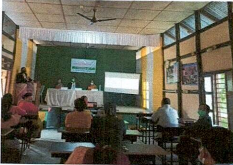
Fig. 1. Welcome Speech

Number of participants: Altogether 27 faculties of higher education participated in the seminar.