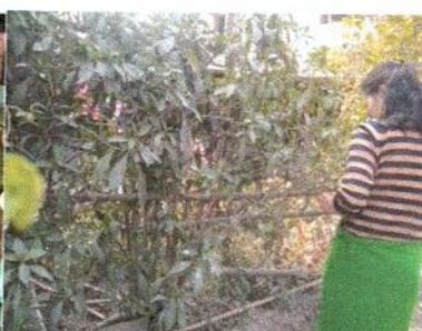
Fig. 3: Students collecting Adhatoda vasica

At the end of the field trip, the students were satisfied and happy that they had explored new flora and collected Herbarium specimens for their semester submission.