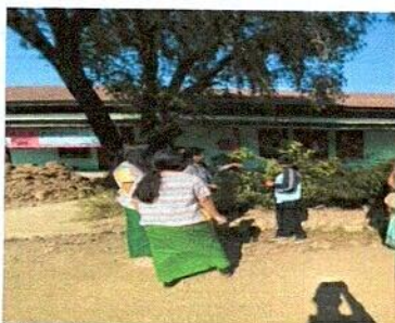
Fig. 1: Students in the field

Collected Herbarium Specimens: Cynodon dactylon (Gramineae), Acorus calamus (Araceae), Allium odorum (Liliaceae), Canna indica (Cannaceae), Ficus benghalensis (Moraceae), Bougainvillea glabra (Nyctaginaceae), Brassica campestris (Brassicaceae), Rosa chinensis (Rosaceae), Pisum sativum (Fabaceae), Acacia nilotica (Fabaceae), Citrus limon (Rutaceae), Hibiscus rosa sinensis (Malvaceae), Coriandrum sativum (Apiaceae), Centella asiatica (Apiaceae), Vinca rosea (Apocynaceae), Ocimum canum (Lamiaceae), Adhatoda vasica (Acanthaceae), Dendranthema grandiflorum (Asteraceae), Ageratum conyzoides (Asteraceae), Gynura cusimbua (Asteraceae), Plantago major (Plantaginaceae), and Jasminum jambec (Oleaceae), etc.