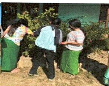
Fig. 2: Students collecting Hibiscus