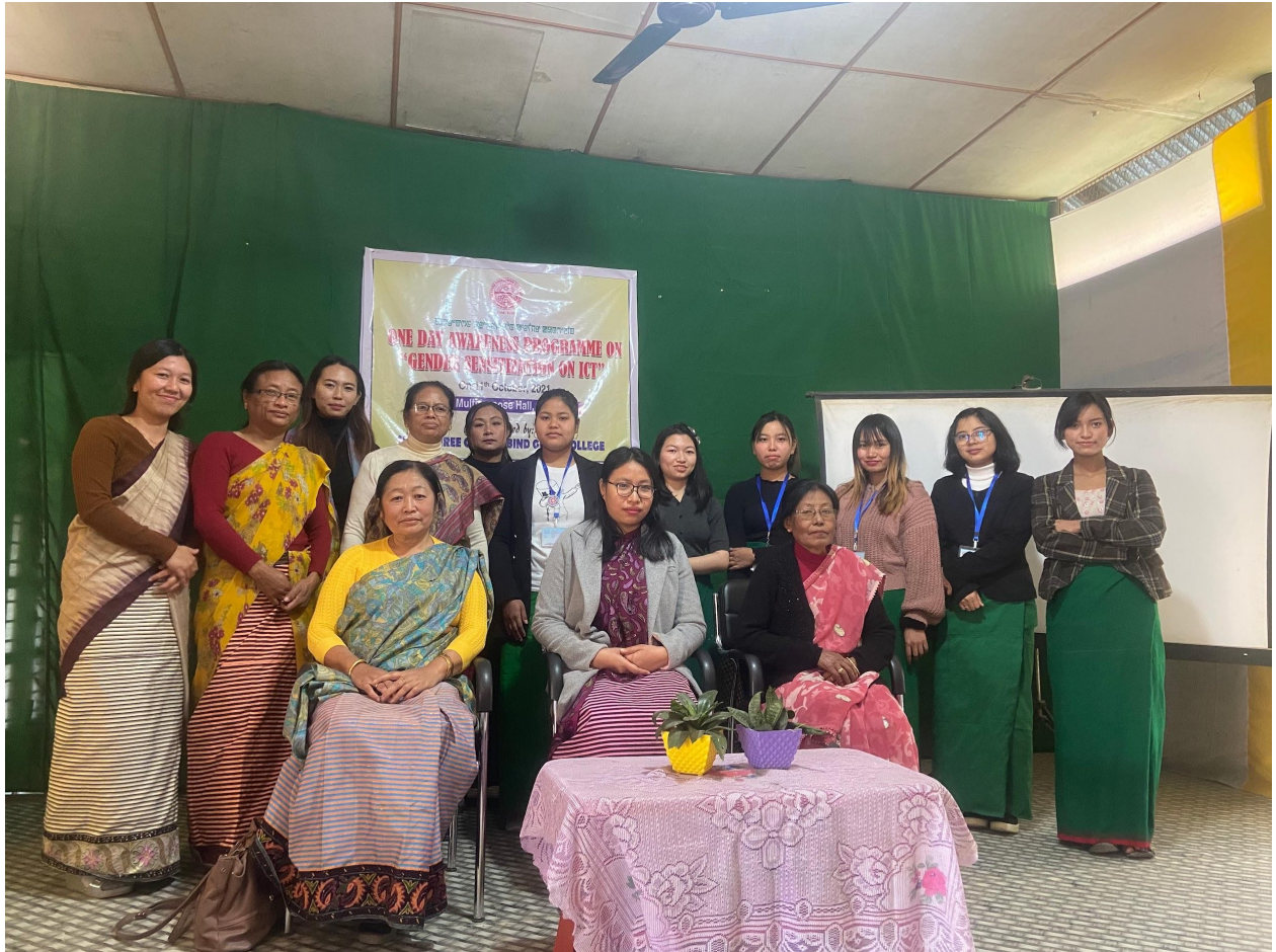
Fig: One Day Awareness Programme on Gender Sensitization on ICT (Best Practice 1)