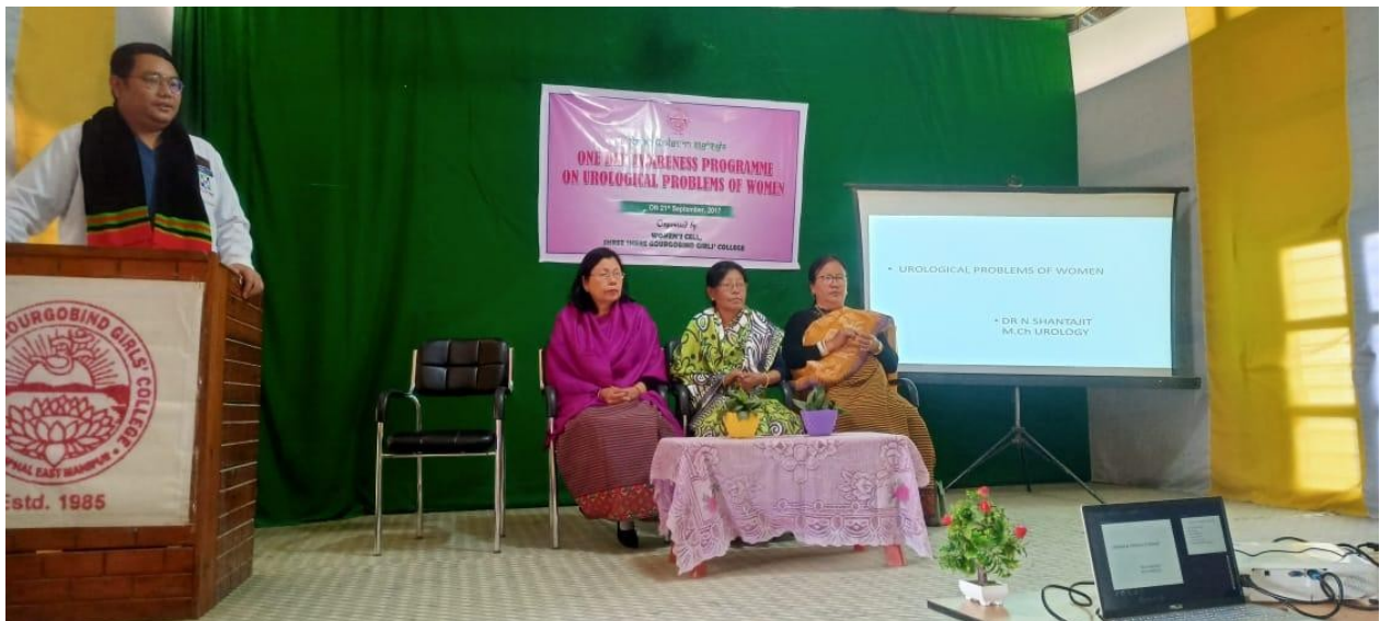
Fig: One Day Awareness Programme on Urological Problems of Women (Best Practice 1)