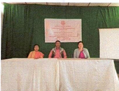
Fig.1 Resource persons

Number of Participants: Altogether 51 participants including students and faculties participated in the programme.