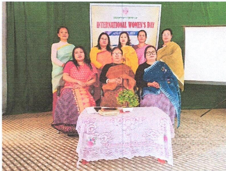
Fig 1. Group Photograph