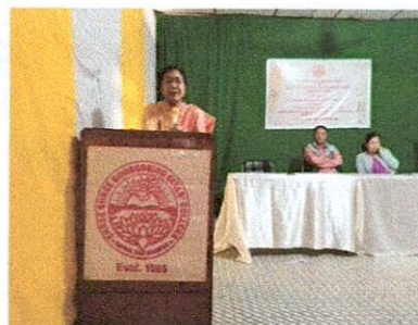
Fig3. Expert Counselling