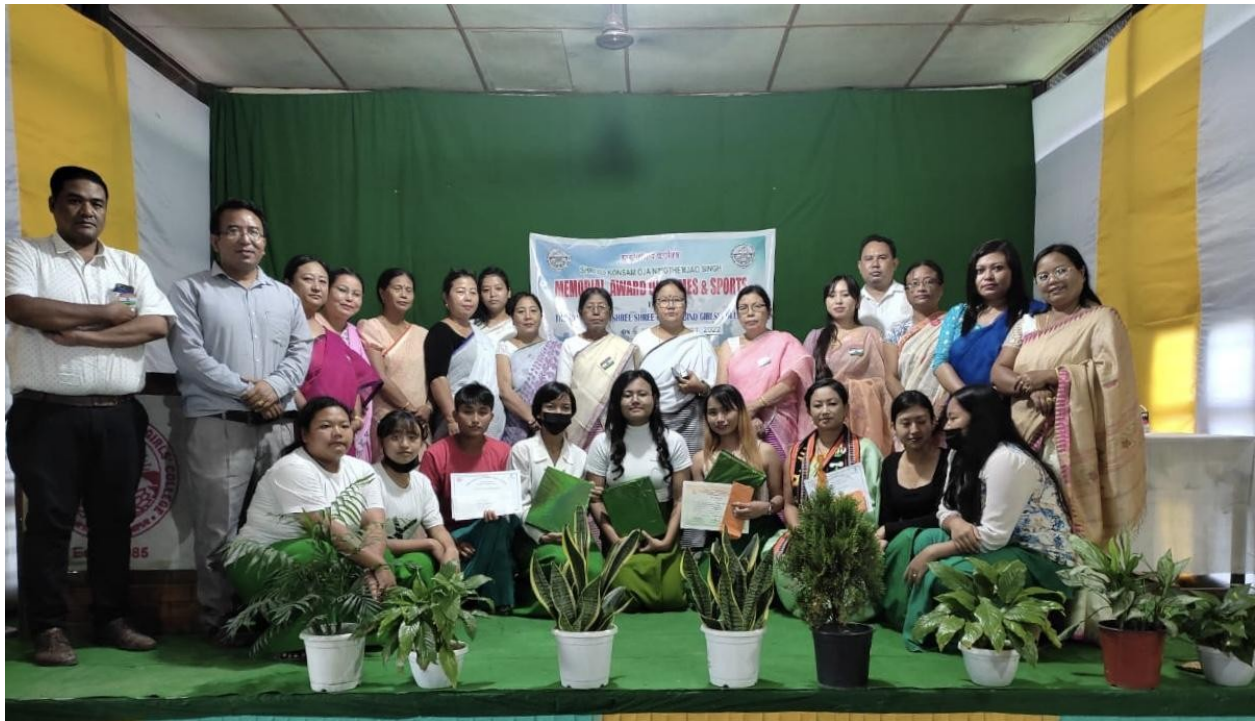
Fig: Meritorious Award on College Foundation Day (Best Practice 2)